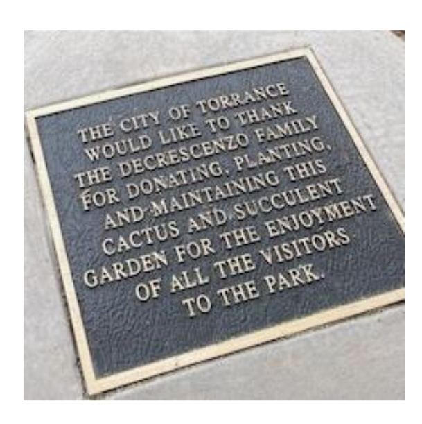
The plaque on top of the tree stump